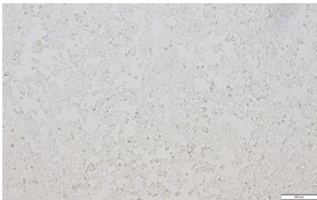
Figure 1. Morphology of HEK-293 cell line

The HEK-293 (293) is a cell line exhibiting epithelial morphology that was isolated from the kidney of a human embryo.