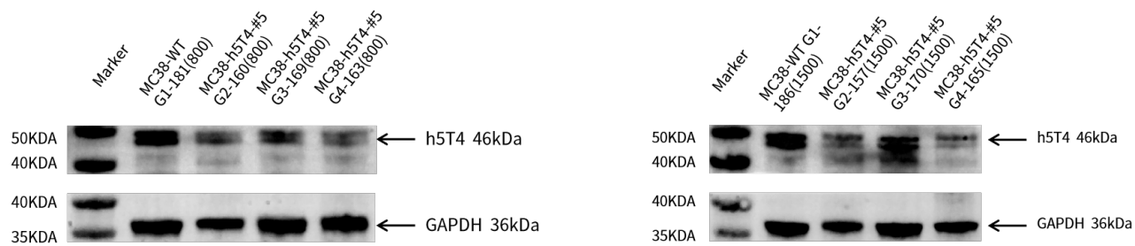
Fig3.5T4 expression in tumors after in vivo growth of MC38-h5T4 in wild type C57BL/6 mice